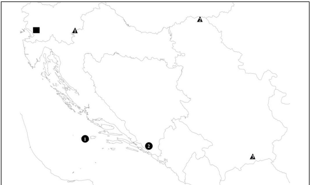
Figure 3. Presentation of recorded species of the genus Strongylognathus Mayr in the western Balkan Peninsula: S. alboini (square); S. dalmaticus (Circles: 1 - Biševo island, 2 - Popovo poljice and S. testaceus (Triangles: 1 - Krapina, 2 - Horgoš, 3 - Cernica).