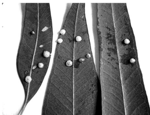
Figure 2. Glycaspis brimblecombei lerps (protective wax covers for the nymphs) on Eucalyptus camaldulensis .

Both A. jamatonica and G. brimblecombei are multivoltine and the climatic conditions in the coastal regions of Montenegro are likely to permit the psyllids to breed through most of the year (they were actively feeding, and all developmental stages were observed, during October 2012) (QUEIROZ et al. , 2012). Albizia and Eucalyptus are relatively common and widely grown in Montenegro and it is highly probable that both psyllids will be found to be more widespread in the country, at least in the coastal region. Both jumping plant-lice species are recorded as plant pests, coating the foliage of their host with honeydew, causing a reduction of photosynthetic area, desiccation, premature leaf fall, dieback, and consequently a reduction in plant growth. Successive defoliations may cause mortality, at least of young plants. Therefore, both A. jamatonica and G. brimblecombei have the potential to damage amenity trees in urban environments and in commercial plant nurseries in Montenegro.