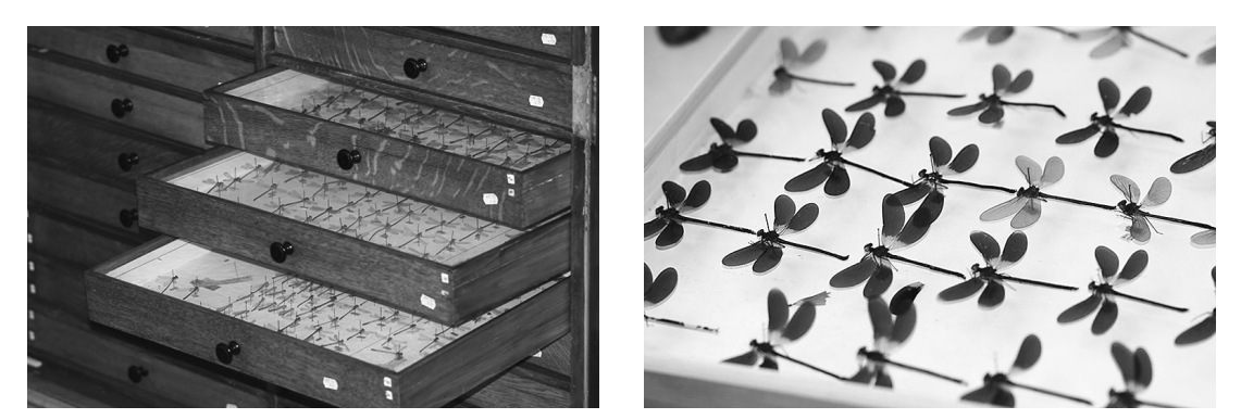
Figure 1. Dragonflies in the entomological collection of Viktor APFELBECK in National Museum of B&H.

In the collection of Viktor APFELBECK 1.079 specimens of dragonflies are stored (Fig. 1). During a survey of the material in this collection 87 specimens of dragonflies from Bulgaria were found.